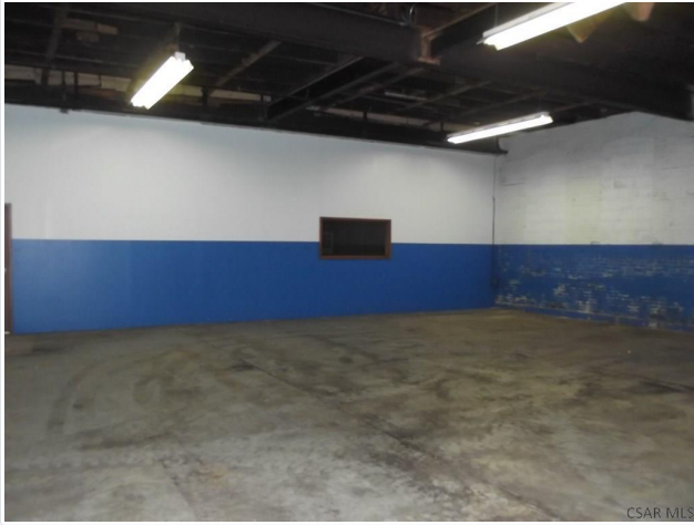
Warehouse Space -Left Side