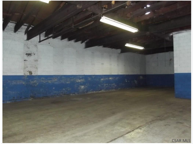
Warehouse Space- Left Side