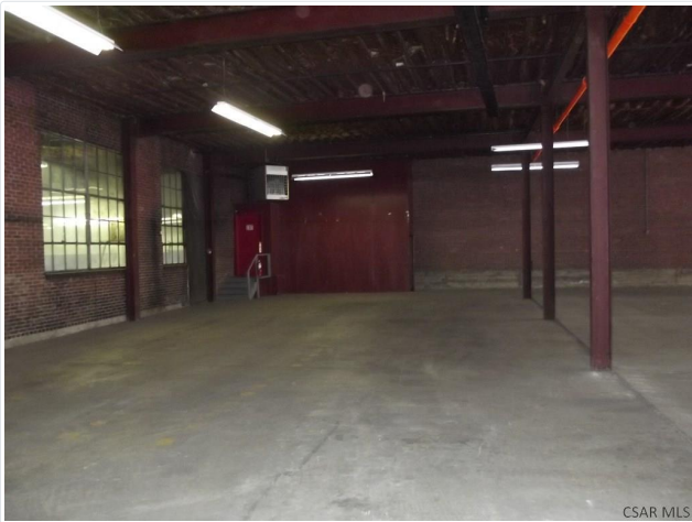
Warehouse space off of loading dock