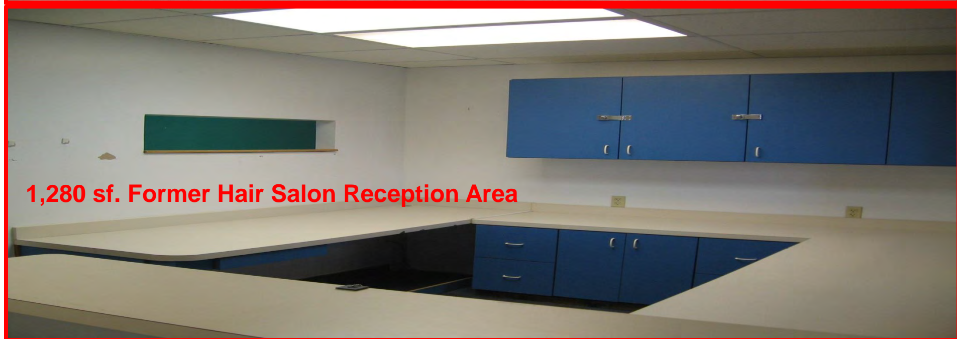
1,280 sf. Former Hair Salon Reception Area