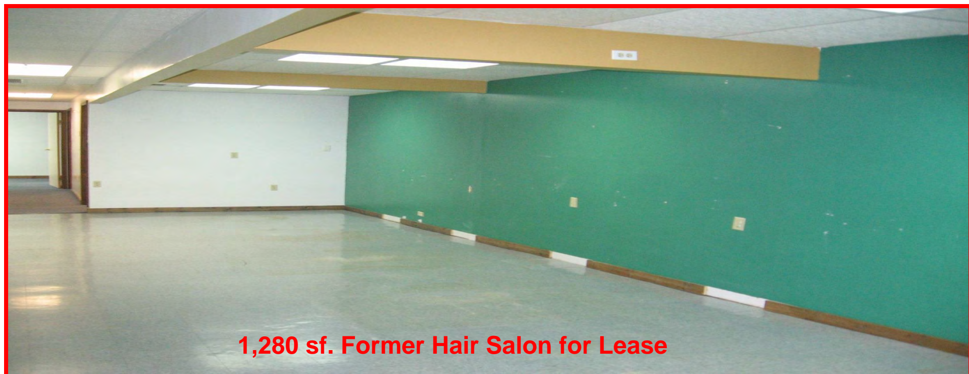
1,280 sf. Former Hair Salon for Lease