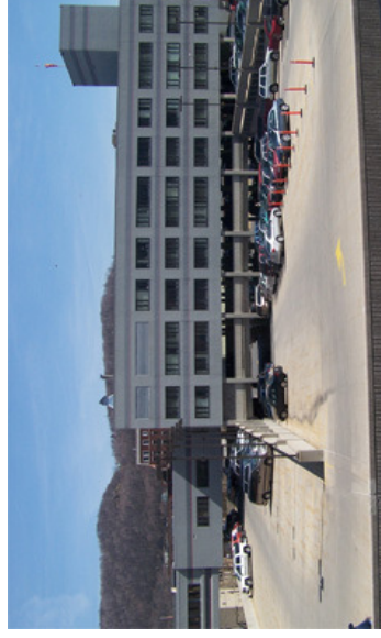
Seifert Parking Garage, also known as the Main Street West Parking Garage.

Numerous office suites available ranging in size from 1000 sq. ft. to 4700 sq. ft.